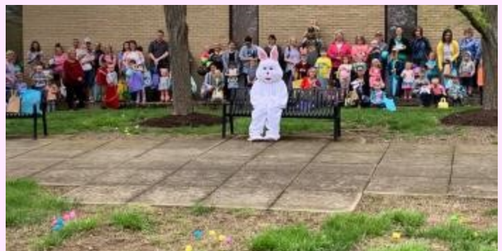
The Easter bunny is ready in downtown Scottsville!

Jelly Bean is shopping in downtown Murray and you should be too! If not Murray, be sure to shop your downtown merchants for your Easter goodies!